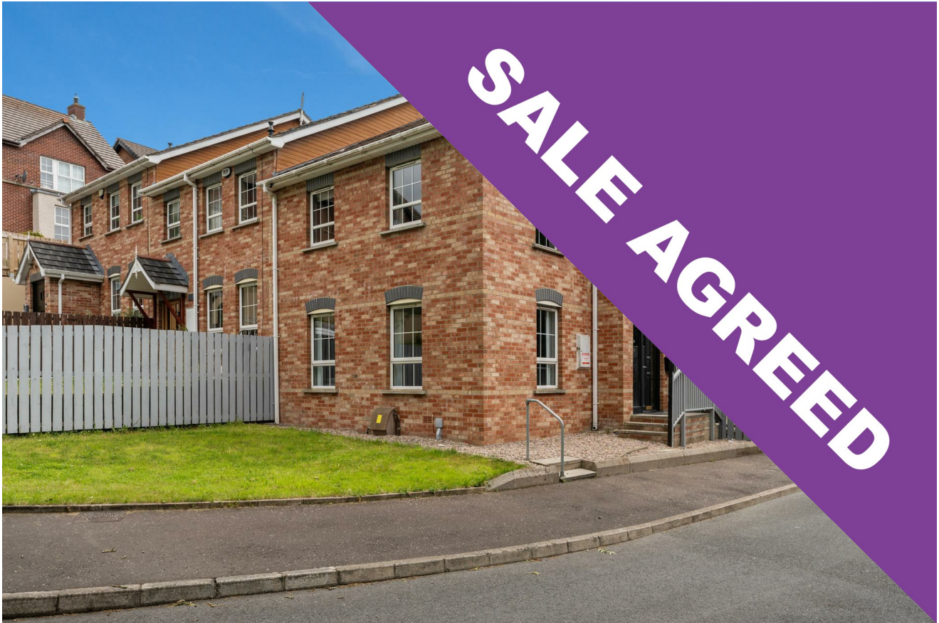
6 Glenview Avenue, Newtownabbey, BT37 0ZX